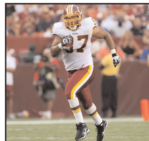
PRESEASON GAME 1 VS. PITTSBURGH STEELERS