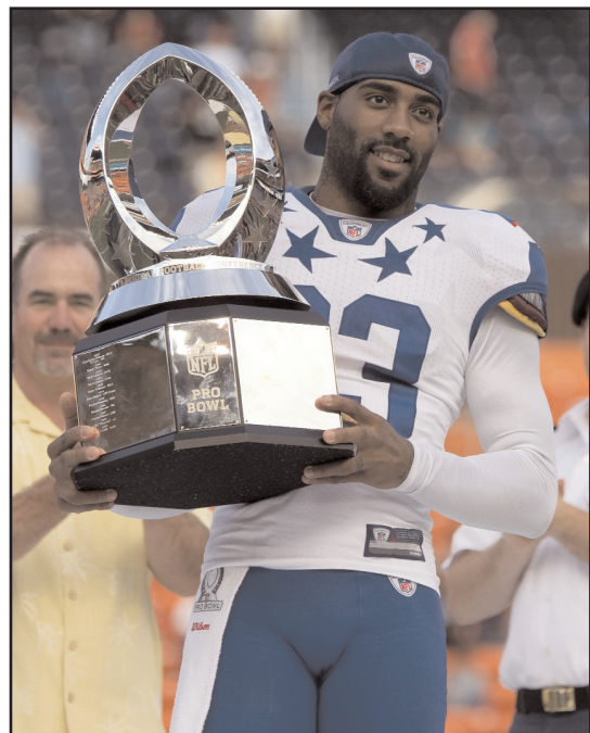
Redskins cornerback DeAngelo Hall was selected to his third Pro Bowl following the 2010 season. He recorded an interception, a forced fumble and a fumble recovery, which he returned for a touchdown, on his way to earning Most Valuable Player honors.

In addition to his propensity for creating turnovers, Hall recorded a career-high 112 tackles (according to coaches film) in 2010, including four for loss. Hall's tackle total was third among NFL cornerbacks (according to NFL GSIS) behind the Giants' Terrell Thomas and the Titans' Cortland Finnegan. Hall's 16 passes defended ranked 11th in the NFL.