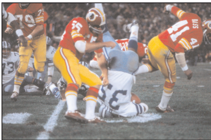
Nine-time Pro Bowler Chris Hanburger was elected as part of the 2011 Pro Football Hall of Fame Class. He became the fourth predominantly Redskins alumnus to be so honored in the last four years.