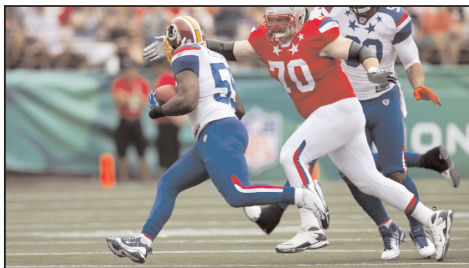
London Fletcher was selected to his second consecutive Pro Bowl following the 2010 season.

In addition to winning the Redskins Defensive MVP Award in each of his first two seasons in Washington, Fletcher has become one of the team's most valuable players in the community. Fletcher earned the Washington Redskins Man of the Year Award in 2008 and 2009 and was one of three finalists for the Walter Payton NFL Man of the Year in 2009.